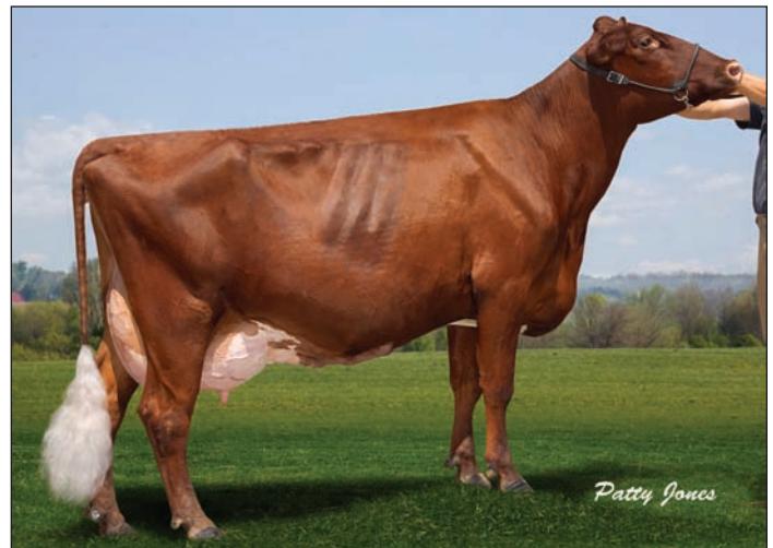
Prinsville Logic Starshine VG-89