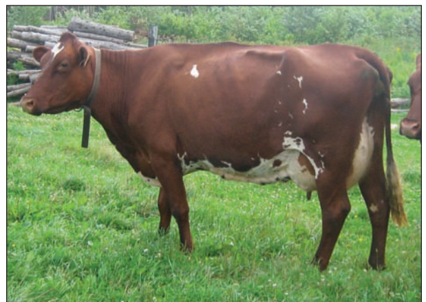
Dam: Fieldcrest Ideal-P EX-92-4E

See a video of this bull online at www.cmss.on.ca/sale2012.php