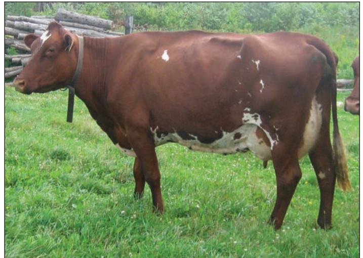
Fieldcrest Ideal-P EX-92-4E CMSS Cow of the Year 2008 Her polled Logic daughter and polled Adam-P son sell!