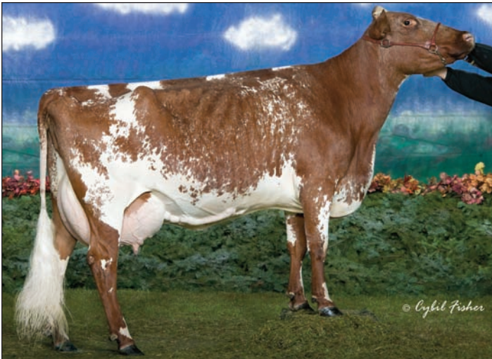
Valley Crest Alice 39 EX-93-4E 5th Mature Cow, World Dairy Expo 2008 Her daughter by Mocha sells!

A remote sale featuring top consignments from breeders in Ontario, Manitoba and Prince Edward Island. Bidding open from 12 to 5 pm ET