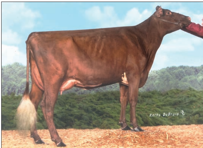
Corstar Liriano Maize EXP VG-89