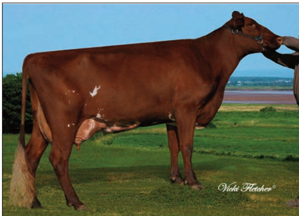
Dam: Oceanbrae Michelle 4th EX-91-5E