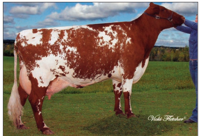
3rd Dam: Oceanbrae Pepper 2nd EX-91-3E